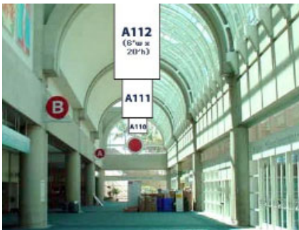
DOUBLE SIDED BANNER- $15,000 LOCATED IN LOBBY, OUTSIDE OF EXHIBIT HALL