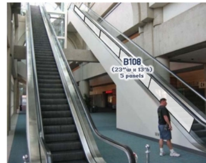
ESCALATOR - $30,000 Place your branding on the escalators that attendees will be using everyday to bring them to and from CME rooms.

Hotel Branding available: Call for Details