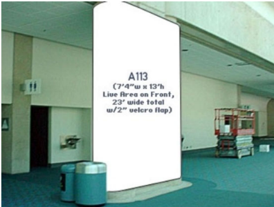
COLUMN WRAP - $15,000