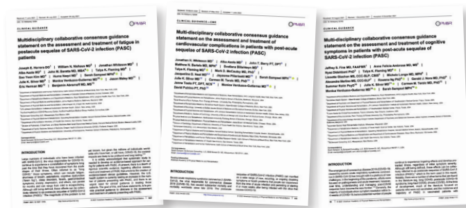
Guidance Statements Through the AAPM&R Multi-disciplinary Post-Acute Sequelae of SARS-CoV-2 infection (PASC) Collaborative