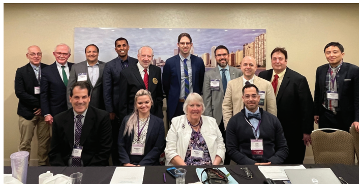
PM&R Section Council lunch

RESOLVED , That our AMA support suppliers of power and manual wheelchairs providing preventive maintenance and repair services for wheelchairs they supply to patients and permit consumers to perform self-repairs as permitted by the manufacturer and when it does not void the warranty.